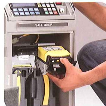
Easy removal for maintenance

Every Armor safe includes a thorough user manual and a "Quick Reference Guide" to get you started. Individual or group training classes are available. Every customer receives free 24/7 phone support for the lifetime of their safe.