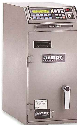
CS-2461 (one single-note bill validator)

Single-note validator dimensions: 12"W x 20"D x 25¼"H (31"H with optional base) Bulk-note validator dimensions: 12"W x 23"D x 25¼"H (31"H with optional base) Approximate weight: 165 lbs Power supply: auto ranging for international or domestic use