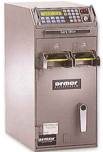
CS-2492 (two bulk-note bill validators)