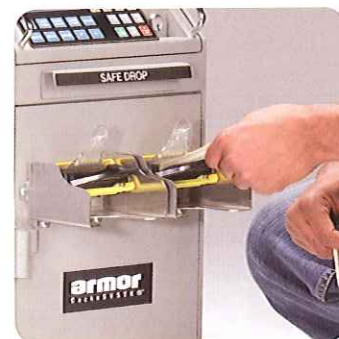
Load up to 50 bills in each bulk-note tray